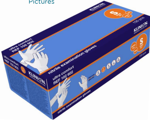
Ref. product 102602