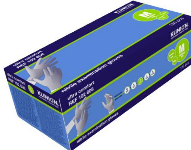
Ref. product 102605